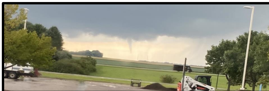
Looking west from the Prairie Justice Center, August 14, 2020